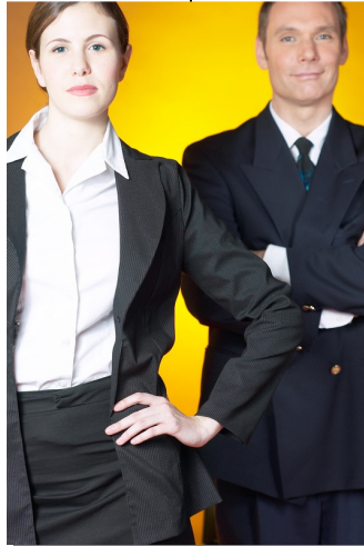
Do You Know How To Measure Talent?