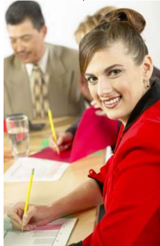
How Are You Improving Morale?